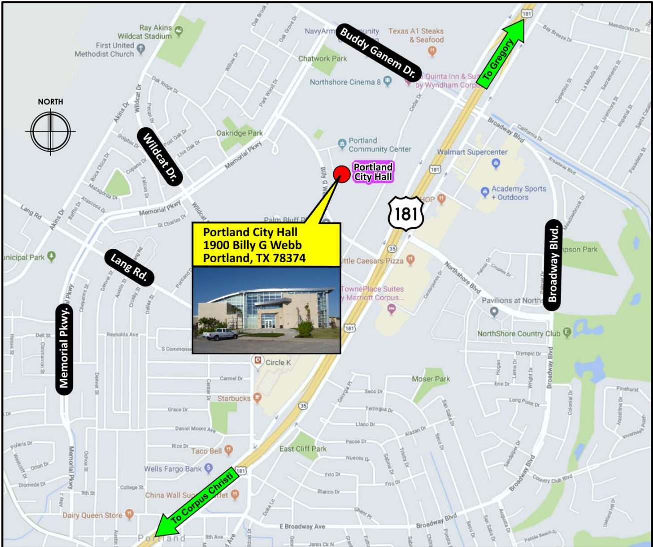
MEETING LOCATION MAP

All MPO Committee meetings are public meetings and open to the public. Any persons with disabilities who plan to attend this meeting and who may need auxiliary aids or services are requested to contact the MPO at (361) 884-0687 at least 48 hours in advance so that appropriate arrangements can be made.