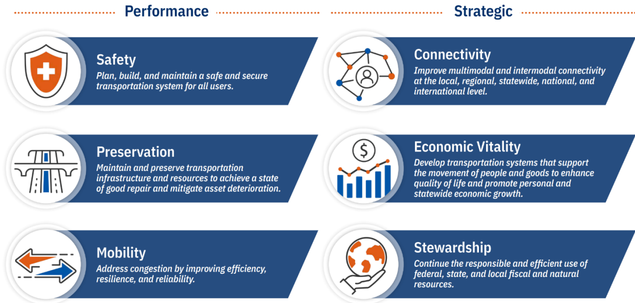
Exhibit 3-1: Connecting Texas 2050 Performance and Strategic Goals

Connecting Texas 2050 identifies six goals that set the foundation for meeting, supporting, and delivering on TxDOT’s mission and vision for transportation across the state. The goals identified for Connecting Texas 2050 are either performance or strategic goals. Performance goals identify specific tasks to ensure a safe, efficient, and resilient transportation system. Strategic goals guide organizational decision-making and provide overall direction to develop a well-connected and future-focused transportation system.