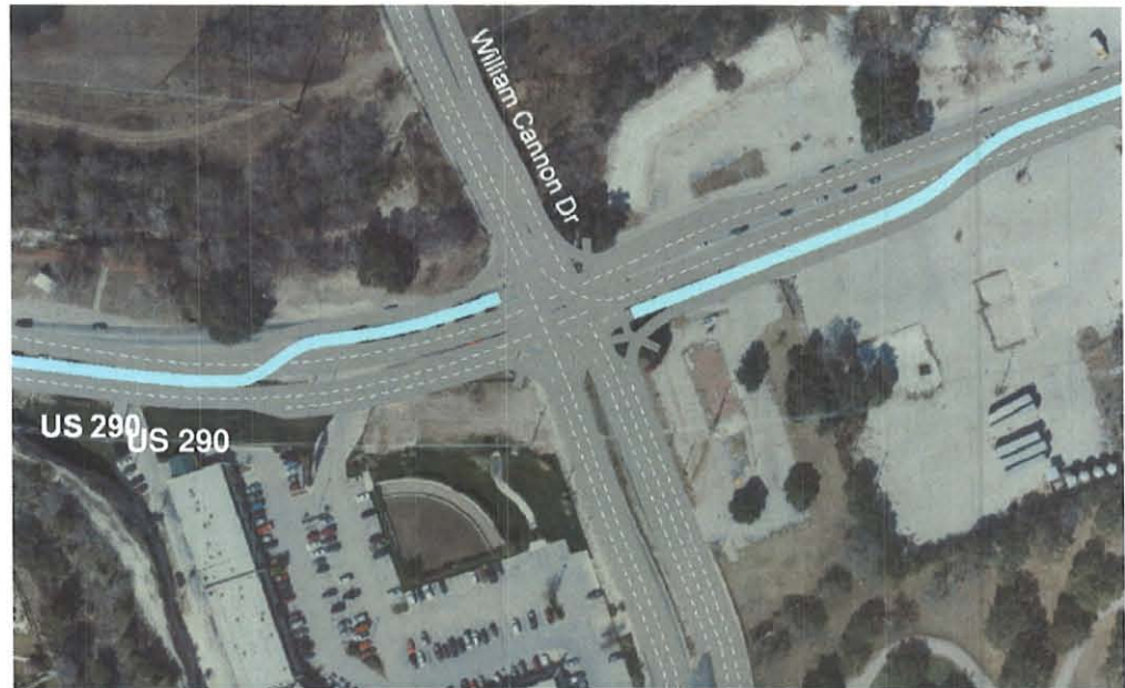
Figure 1. Example CFI layout to be constructed in Austin, Texas.

provide smooth continuous traffic flow. This configuration allows the left turns and through vehicles to travel through the intersection at the same time thereby eliminating the separate left turn phases. This is especially beneficial at intersections where left-turn traffic is heavy and left turns are protected, which takes valuable time away from the through movements.